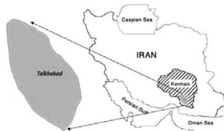
Fig. 1. Location of the study area in Talkhabad, Kerman province (Iran)

only the fruit fallen onto the ground were collected during the spring sampling. In summer, the fruit of that species was not observed. Herbage samples were hand-sorted in the laboratory into several subsamples at the species level, and the subsamples were subsequently dried at 65°C for 48 h to a constant weight (Milotic et al. , 2010). Next, the protein content of each plant species was measured using the Kjeldahl crude protein method (AOAC, 1984).